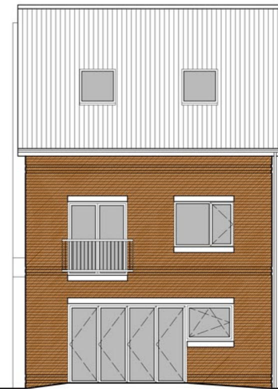
WEST ELEVATION SCALE 1:100