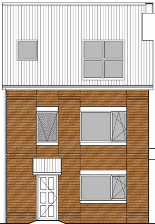
EAST ELEVATION SCALE 1:100